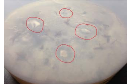
Cypripedium acaule contamination plate (6/9/16)